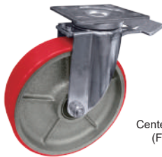
Center Lock Brake (For 8" only)