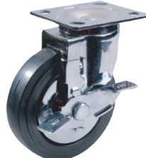
Side Lock Brake (For 4", 5", 6" only)