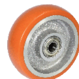
铝芯AXPU XPU on AL Core