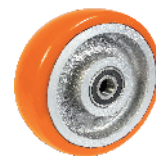
铁芯XPU XPU on Iron Core